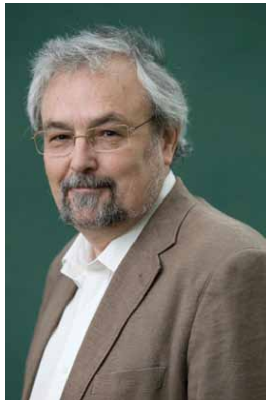
Prof. Robin IM Dunbar

Addressing the participants from various countries, Professor Dunbar said, "Despite the fact that, these days, we humans often live in vast conurbations like Mumbai and London, the human social world is actually very small indeed. I originally predicted its size from a regression equation relating social group size in different species of monkeys and apes to the size of their brains. When I plugged human brain size into this equation, it predicted a group size of 150. This is the number now known as Dunbar's Number, or the Dunbar Number. A large sample of both personal social network size and community size in both the real face-to-face world and the online social world confirms that this number is the typical size of natural human groups: a sample of 22 such estimates yielded an average group size of 154. Essentially, this is the number of friends and family that you can have meaningful relationships with. Of course, this is only the average: individuals vary between about 100 and 250 depending on their age, gender and how sociable they are."