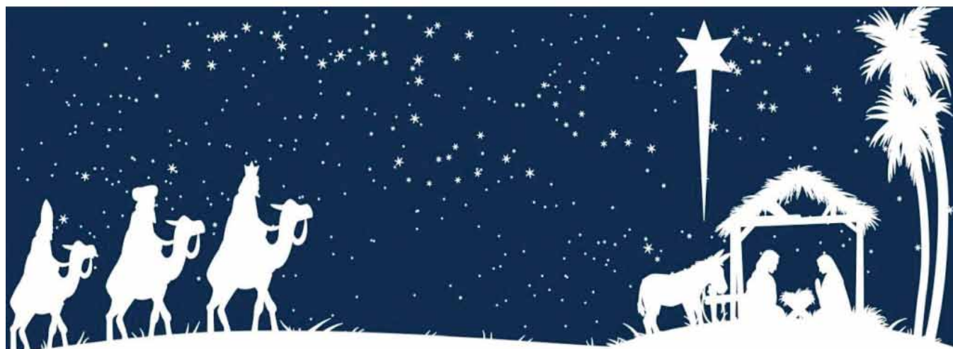
- Don Bosco University Family Guwahati, India

CHRISTMAS 2015 ... May peace and joy accompany you as you travel on in hope NEW YEAR 2016 ... May a basketful of dreams unfold along the way for you!