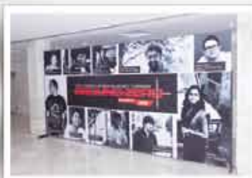
Vice Chancellor at World Congress on Education